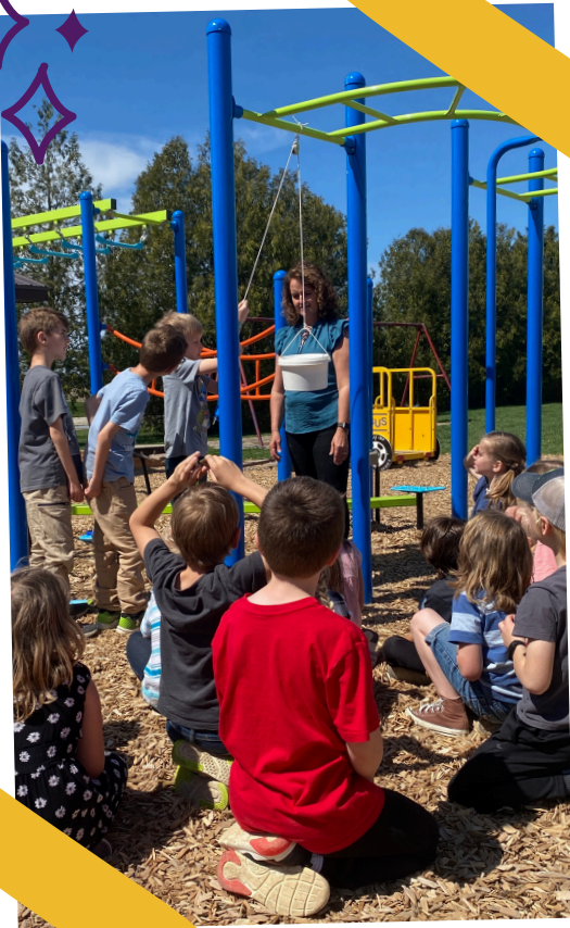
Grade 2 students participate in a hands-on demonstration of pulleys in their simple machines science unit.

God designed and built children with creativity, energy and brilliant minds; we give Him the glory!