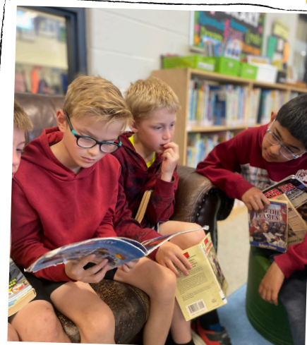
Fourth-grade readers in the library

Students in grade 8 are exploring the theme of prejudice in literature class. Small groups have chosen a novel study from a curated list of books. Students will experience a new novel and develop vocabulary, writing and comprehension skills. Beyond that, our goal for the senior class is to become more aware of what prejudice looks like and what our Christian response should be.