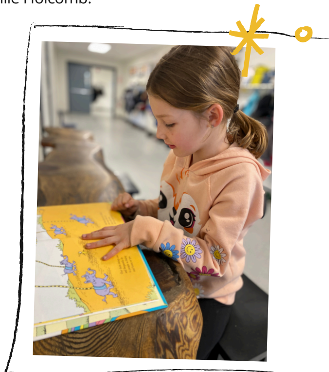
A grade 1 student enjoys reading a Dr. Seuss classic.